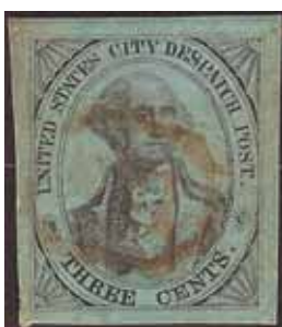
Figure 7. The 6LB5, black on blue green adhesive.