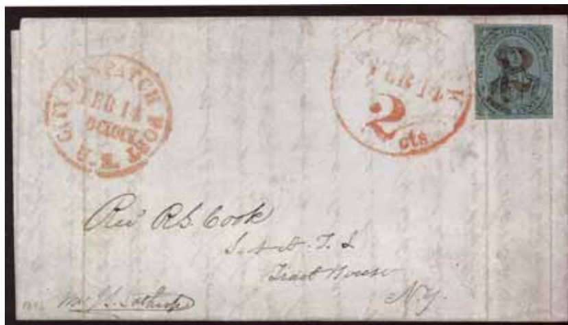
Figure 13. The only recorded U.S. City Despatch Post cover with both the U.S. City Despatch handstamp and the New York City circular datestamp indicating the 2 cts drop letter rate. The adhesive has the price struck out. This is the 6LB7 adhesive. There are three recorded covers with this adhesive.