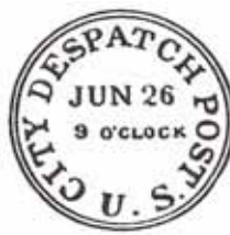
U.S. City Despatch Post datestamps