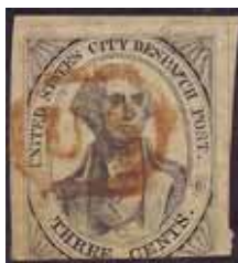
Figure 4. The U.S. City Despatch adhesive in wheat. This is an unsurfaced paper colored through adhesive which is not yet listed in the Scott Specialized Catalogue .