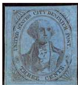
Figure 8. The 6LB5b, black on blue adhesive which was issued in the fall of 1844.