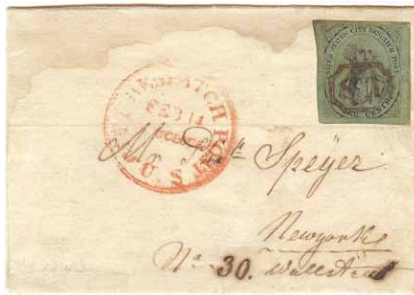
Figure 10. An early black on green glazed paper adhesive on a folded local letter dated February 14, 1843 to 30 Wall Street. The U.S. City Despatch Post datestamp is the double circle type. This is a true green glazed paper adhesive. Stamps issued later are not as green.

There are early examples of the black on green glazed adhesives and there are late examples of black on green glazed adhesives. These colors have been lumped together under one generic color name. This author has extensively studied the colors of the adhesives and they are not the same. The early examples are much greener and were probably printed in November 1842. These were in used until the black on light blue glazed adhesives and the black on blue green glazed adhesives were issued in January 1843. An example of the early black on green glazed paper adhesive can be seen in Figure 10 . It is on a folded letter dated February 14, 1843 to 30 Wall Street. The early black on green glazed paper adhesives are very scarce. The later black on green glazed adhesives are basically variations in color shades of the black on blue green adhesives issued and reissued from 1843-1846.