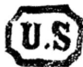
U.S. City Despatch Post handstamp