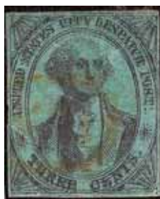
6LB5a Black/blue green