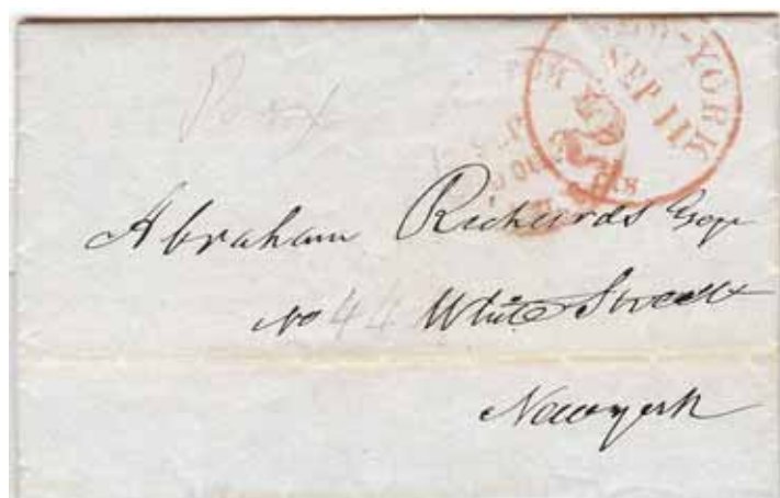
Figure 14. A drop rate cover from the new rate period which began July 1, 1845 and required 2 cents for a drop rate fee. The previous rate was 1 cent. This cover also has the datestamp of the U.S. City Despatch Post.