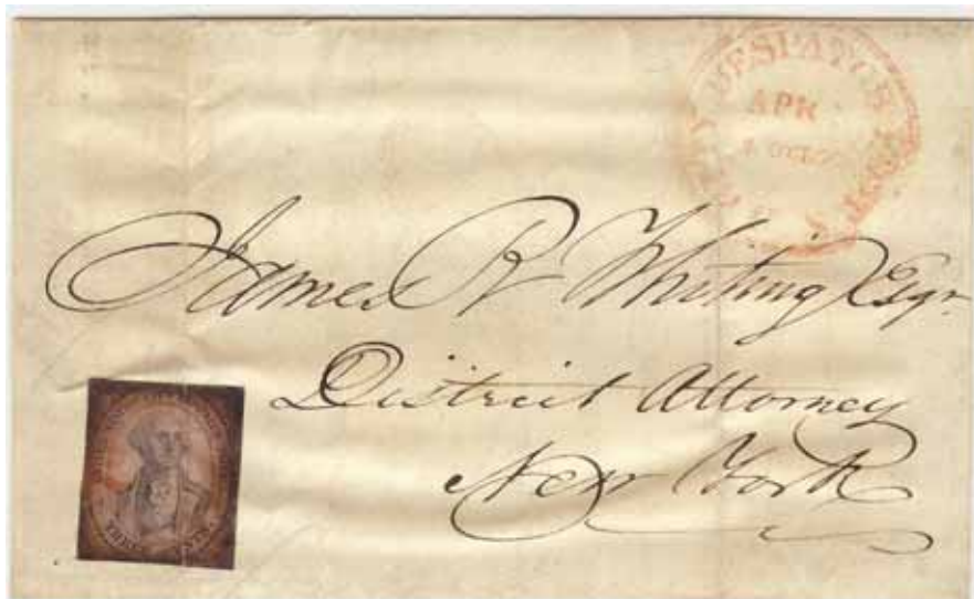
Figure 11. A black on pink unglazed surface colored adhesive 6LB6, on a cover front dated April 7, (1843). This is the only recorded example. The datestamp is the double circle which was not in use after 1843.

Double impression errors on glazed surface paper adhesives occurred in three different colors. These are shown in Figure 9 .