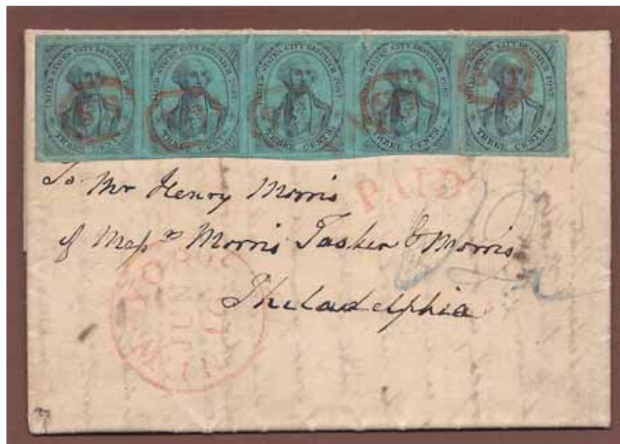
Figure 12. An example of intercity mail with five United States City Despatch Post adhesives.