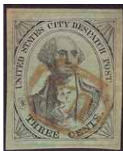
Figure 6. The 6LB5d adhesive is a black on green stamp on glazed surface colored paper. It is the first glazed paper stamp issued by the government in the United States. It was issued in the fall of 1842.