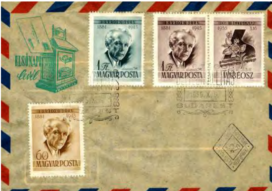
First day cover, Bela Bartok, Hungarian composer (Volume 3, page 11)