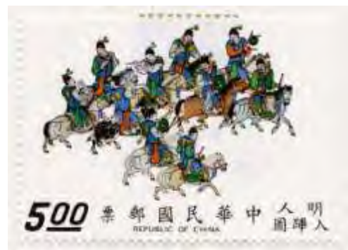
Parades and Marching (Volume 21, page 2)