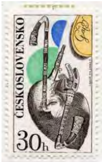
Bagpipes, Czechoslovakia (Volume 14, page 40)