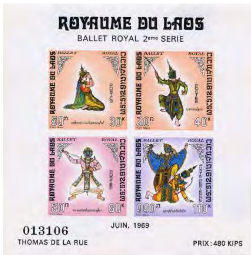
Commemorative print, Laotian Royal Ballet, 1969 (Volume 1, page 14)