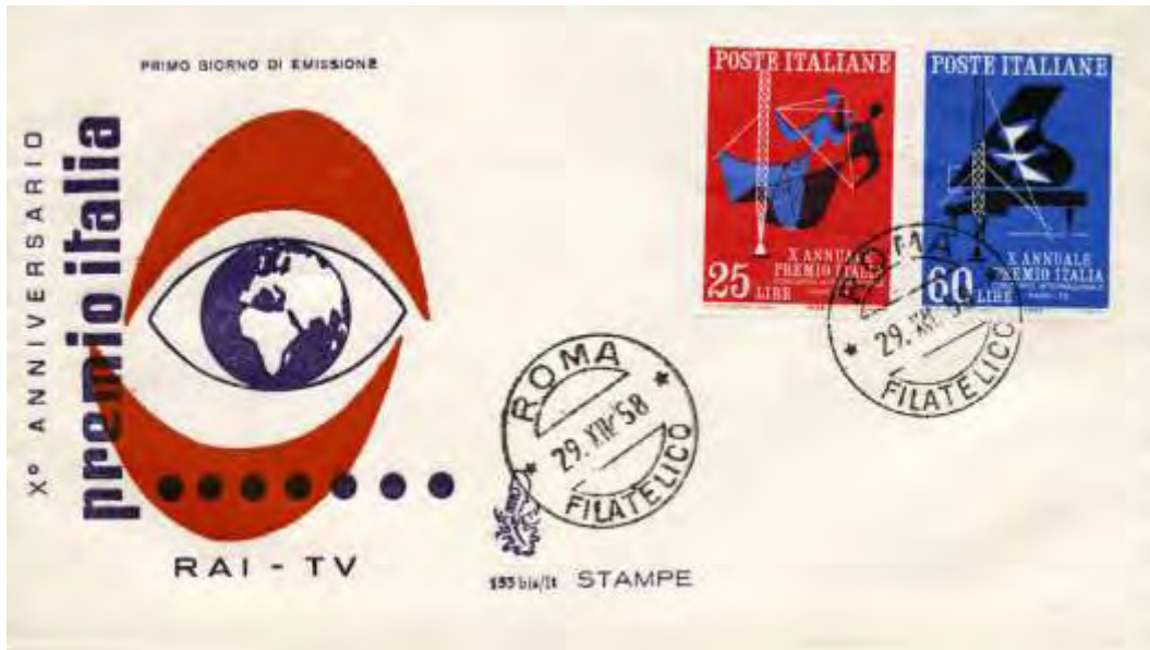
First day cover, Italian broadcasting, 1958 (Volume 1, page 46)