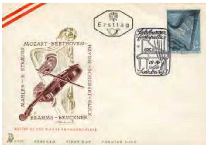
1959 First day cover, Vienna Philharmonic (Volume 1, page 19)