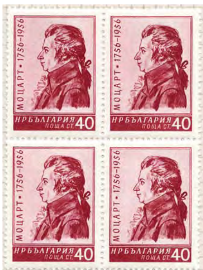
Block of four stamps depicting Mozart

single stamp); Bohemia and Moravia (2 b/4, 1 single stamp, 9 b//4); Bolivia (8 b/4, 16 single stamps, 2 commemoratives); Brazil (8 b/4, 14 single, 2 b/14, 1 single, 4 b/2);