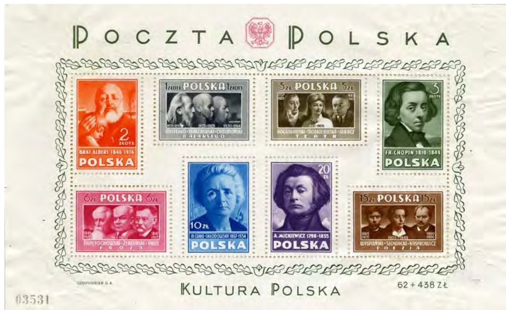
1947 Souvenir Sheet with Polish Cultural Heros