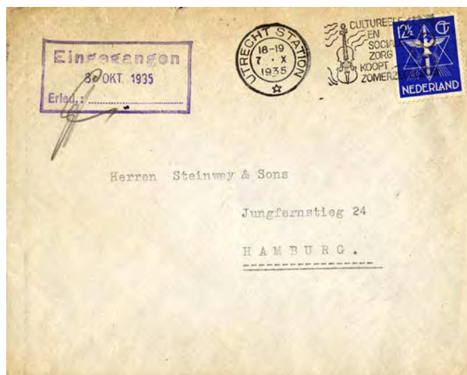
Meter slogan cancel showing a violin

Volume 3. 62 pages containing approximately 617 stamps representing 89 countries with Musical theme stamps from Indonesia to Portugal: