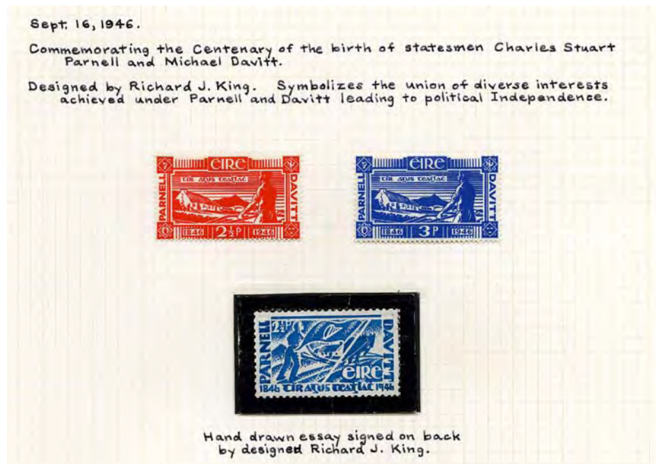
1946 "Plowman" issue - Scott 133 - 134 with hand-drawn essay of Scott 133