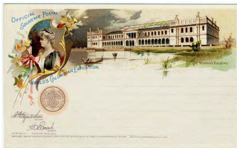
Columbian Exposition Souvenir Postal Card (Woman's Building), 1893 (Accession No. 2000.2007.11)

Third Assistant Postmaster General Stamp Design files by Scott number