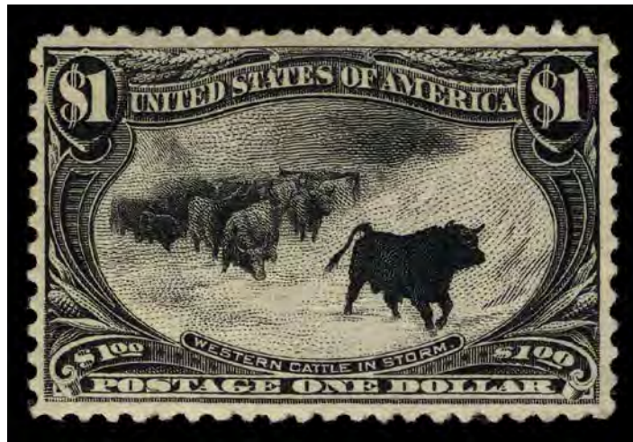
Western Cattle in a Snow Storm, Trans-Mississippi Exposition, 1898 – Scott 292 (Accession No. 1980.2493.2000)