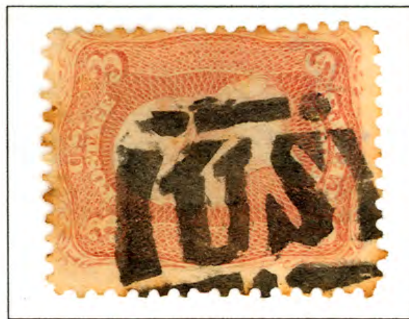
“US” IN SEGMENTED FRAME