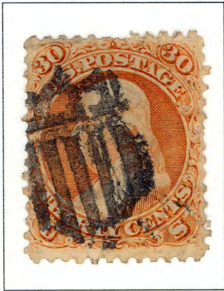
SHEILD WITH STARS AND BARS