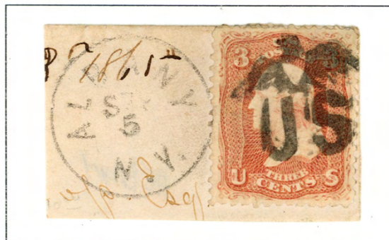
EAGLE ATOP “US” ALBANY, NY SE PT-E 12