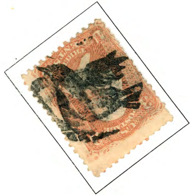
PEACE DOVE NEW YORK SE PA-B 9