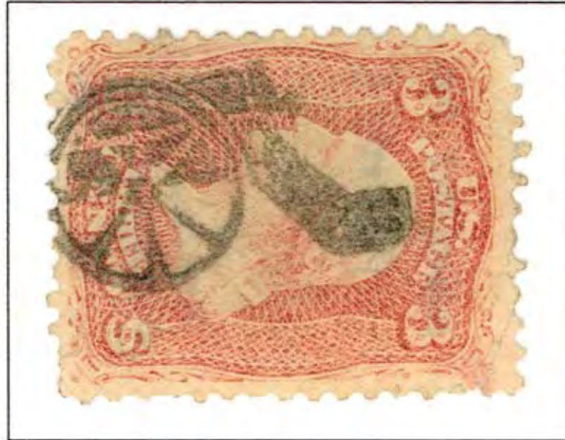
CANNON NEWCASTLE, PA SE PO-Ms 5

“A Nation at War: Contrasting Postal Systems”