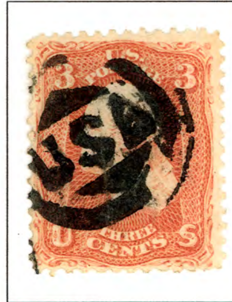
“USA” NEW YORK SE PT-USA 5A