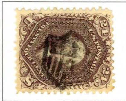
SHIELD WITH STARS & BARS SACRAMENTO, CA SE PS-ST 43