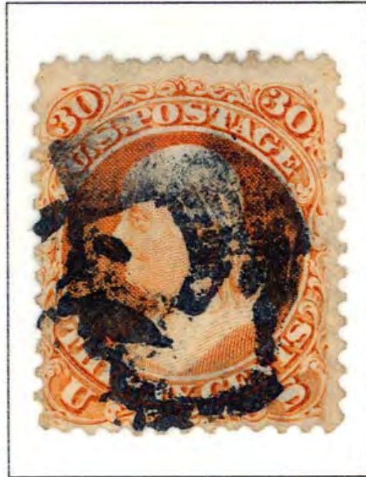
SOLDIER'S HEAD NEW YORK FOREIGN MAIL SE PH-F 72

“A Nation at War: Contrasting Postal Systems”