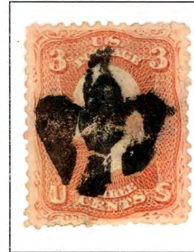
EAGLE CAMBRIDGE, MA UNLISTED