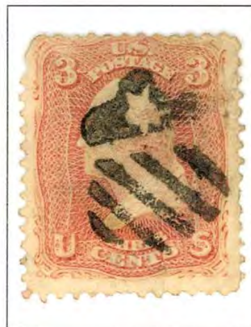
SHIELD WITH STAR WILLISTON, VT SE PS-ST 52