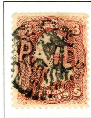
NEGATIVE "PAID" IN SHIELD DEDHAM, MA SE PM-PE 4