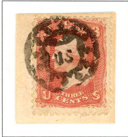
“US” IN NEGATIVE SHIELD IN CIRCLE OF NEGATIVE STARS ALBANY, NY SE PT-C 18