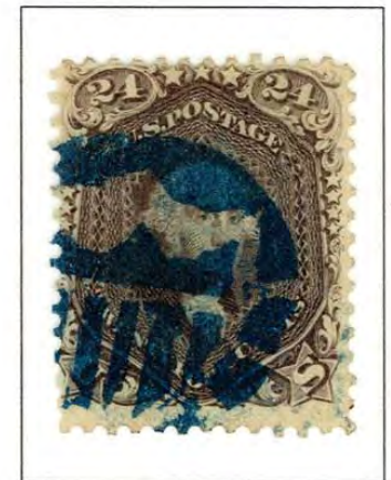
BLUE SHIELD IN CIRCLE CHICAGO, IL SE PS-FC 12