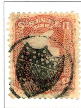
“US” IN SHIELD IN CIRCLE SE PT-C 14