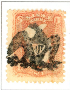
EAGLE WITH SMALL SHIELD ON BRANCH CORY, PA SE PT-E 4