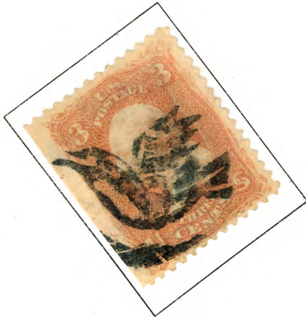
PEACE DOVE NEW YORK - WORN STRIKE SE PA-B 9