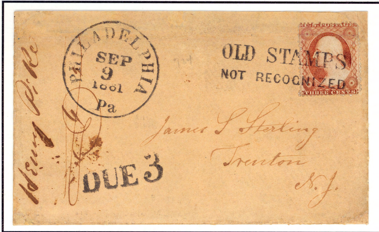
“OLD STAMPS / NOT RECOGNIZED” PHILADELPHIA, PA (RESTORED AND REPAIRED) SE PM-OS 1