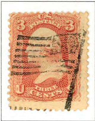
FLAG HEALDSBURG, CA SE PT-F 33