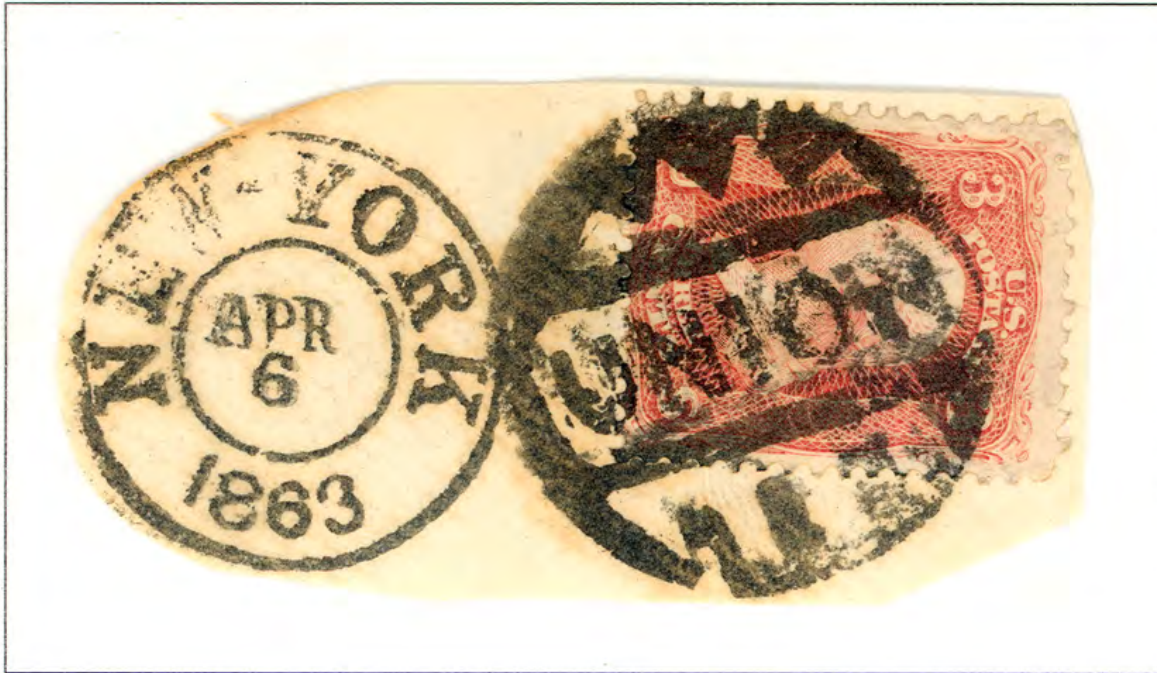
LARGE “UNION” IN SHIELD NEW YORK SE PT-UN 4

“A Nation at War: Contrasting Postal Systems”