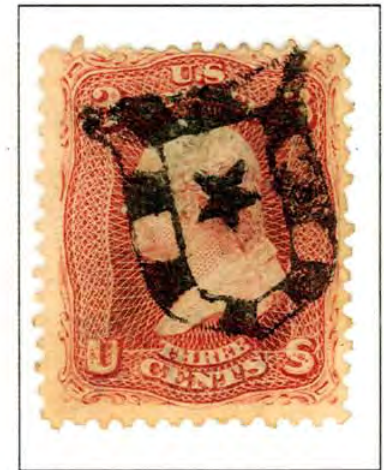
SHIELD WITH CENTER STAR MADALIN, NY SE PS-C 9