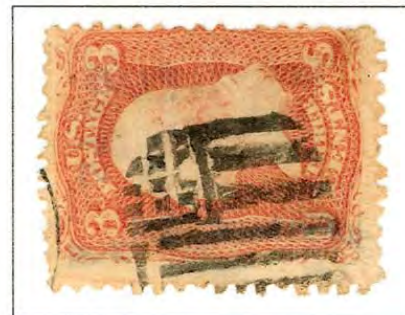
FLAG WEST POINT, GA UNLISTED