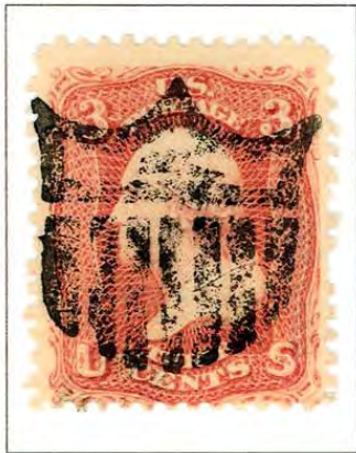
SHIELD WATERBURY, CT - WORN ROHLOFF Q-3