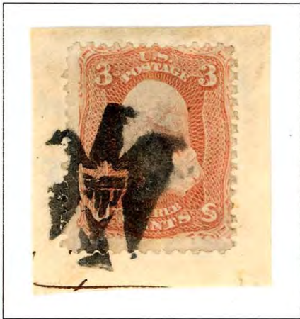
EAGLE WITH SHIELD CAMBRIDGE, MA SE PT-E 5