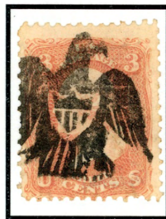
EAGLE WITH SHIELD WATERBURY, CT ROHLOFF A-7