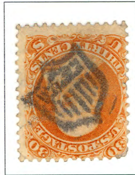
BLUE SHEILD WITH STARS AND BARS