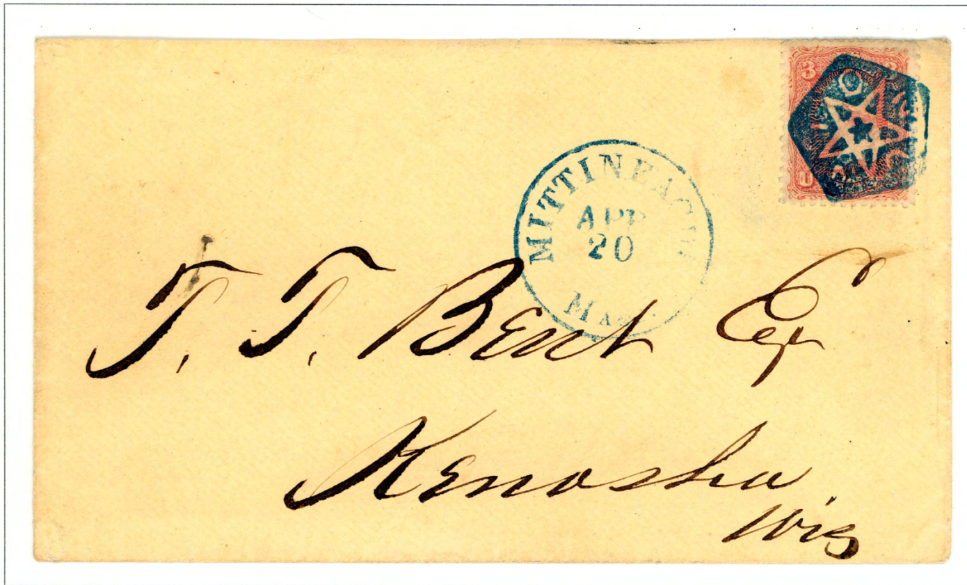
NEGATIVE "UNION" & STAR IN BLUE PENTAGON MITTINEAGUE, MA SE PS-C 15

“A Nation at War: Contrasting Postal Systems”