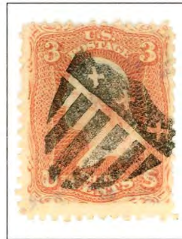
SHIELD WITH “X”s BOSTON, MA SE PS-ST 27