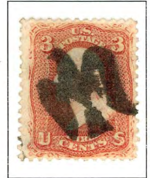
EAGLE CAMBRIDGE, MA SE PA-B 23A