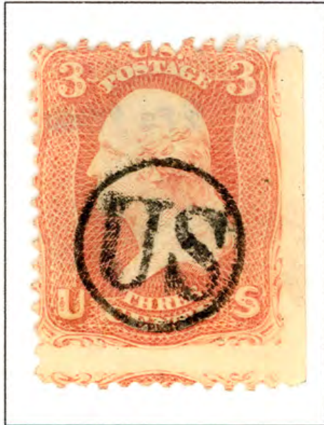
“US” IN CIRCLE KEESEVILLE, NY SE PT-US 61