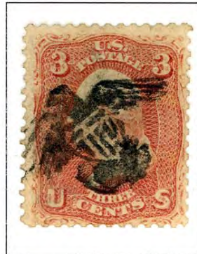
EAGLE WITH SHIELD SE PT-E 7