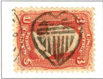
SHIELD IN HEART BRIDGEPORT, CT SE PH-H 60