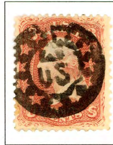
“US” IN NEGATIVE CIRCLE IN CIRCLE OF NEGATIVE STARS ALBANY, NY SE PT-C 19