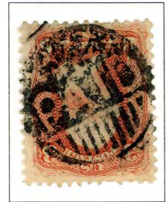
NEGATIVE "PAID" IN SHIELD DEDHAM, MA SE PS-C 13