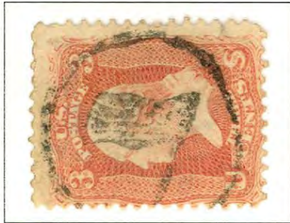
FLAG IN CIRCLE SE PT-F 21