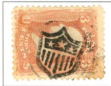
SHIELD WITH STARS SACRAMENTO, CA SE PS-FC 52