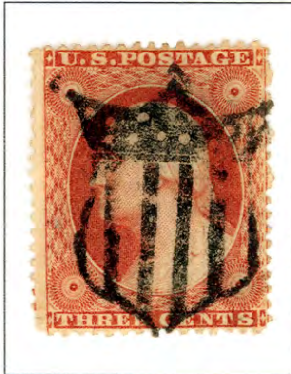
SHIELD OF DOTS & BARS

“A Nation at War: Contrasting Postal Systems”