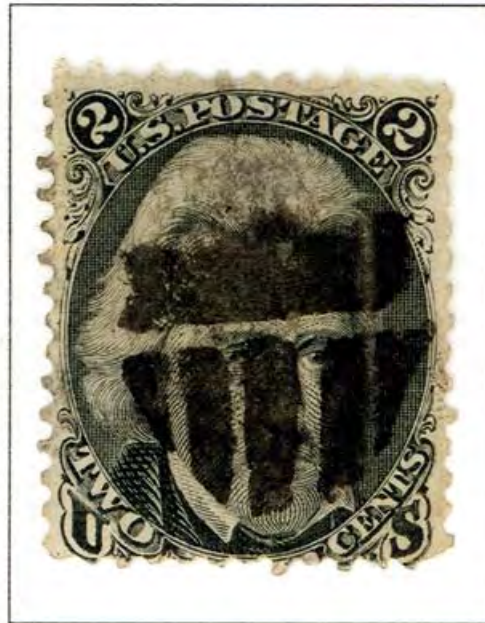
SHIELD - SOLID TOP CAMBRIDGE, MA SE PS-S 15