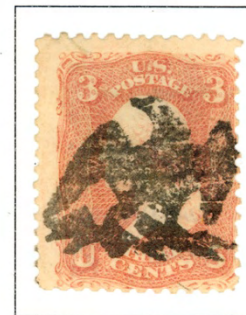
EAGLE ON BRANCH WOONSOCKET FALLS, RI SE PT-E 8