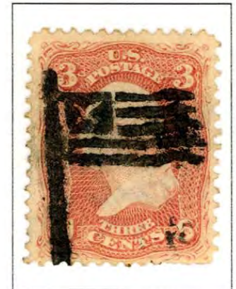
FLAG CARTHAGE, IL SE PT-F 11