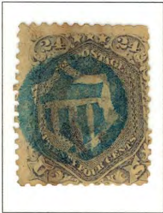
BLUE SHIELD MEMPHIS, TN SE PS-FC 20