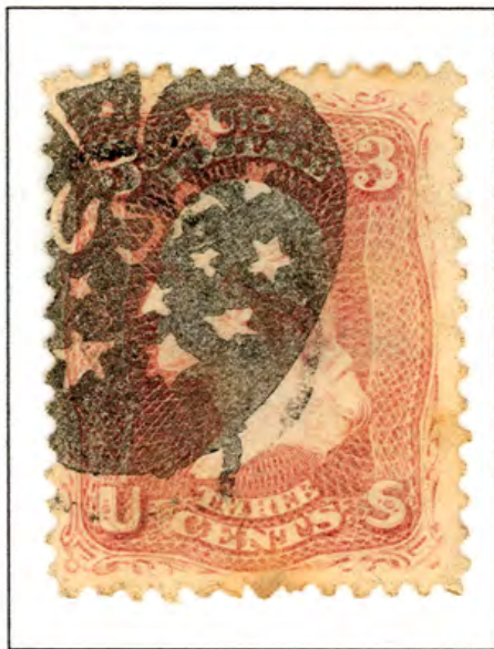
NEGATIVE “USA” IN CIRCLE WITH NEGATIVE STARS