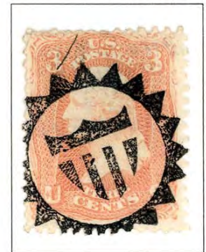
SHIELD IN GEARED CIRCLE SOUTH LANCASTER, PA SE PS-FC 9