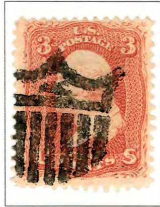
SHIELD WATERBURY, CT ROHLOFF Q-3