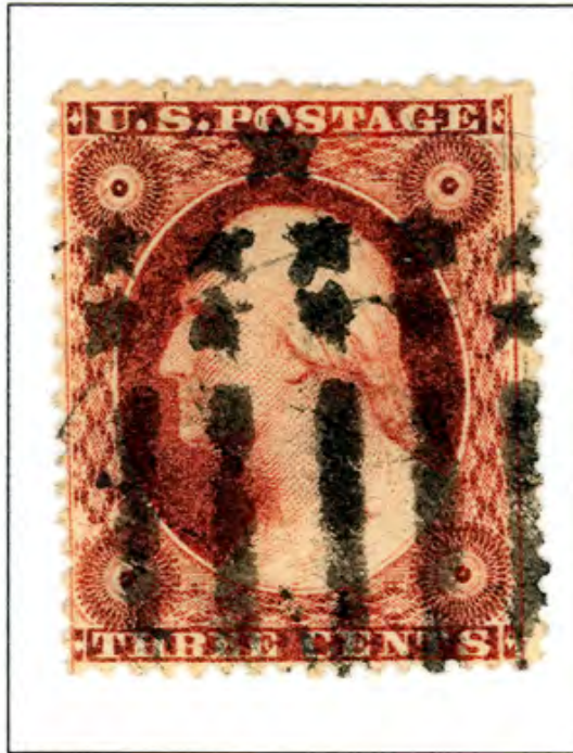
SHIELD OF STARS & BARS UNLISTED

“A Nation at War: Contrasting Postal Systems”