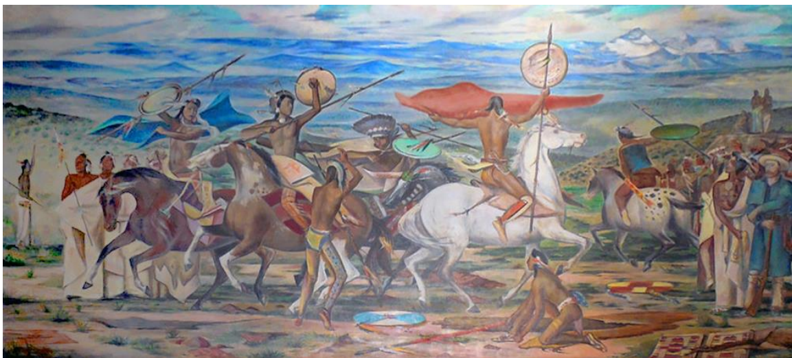
Fig. 2. Hamilton, Montana Post Office Mural painted by Henry Meloy 25

Thus, “All of these visual stories, created as a result of this national contest, were the work of mostly non-Native artists whose chosen themes were also influenced by the desires of local post office communities. Many of the artists were unfamiliar with the region connected to the post office they were assigned, and most, unless they were Native artists themselves, were unfamiliar with American Indian culture. While some mural images succeeded in capturing the importance of Native peoples in the American historic tableau as a result of an increased national consciousness, others were based on rumor, legend, and stereotype resulting in dramatic and sometimes bizarre inaccuracy. Post office murals across the United States are telling and re-telling these American Indian stories to the general public every day.” 24