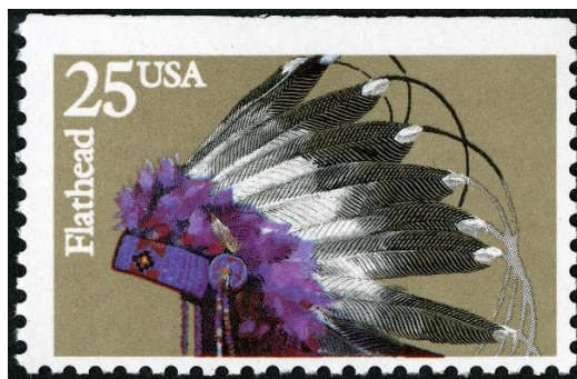
Fig. 4. Flathead Headdress

In 2001, The Smithsonian NPM and NMAI along with the USPS also developed an online virtual stamp exhibition titled, The American Indian in Stamps: Profiles in Leadership Accomplishments and Culture Celebration . 35 The stamps, supported by images of artifacts and cultural histories from NMAI, illustrated Profiles in Leadership, Restoring Economies, and American Indian Arts as Renaissance of Traditions. In 1990 the United States Postal Service issued a stamp illustrating an historic “Flathead” headdress made of felt and large golden eagle tail feathers alongside ermine skin and white cow-tail hair tied to the end of each feather. (Fig. 4) The headdress in this illustration of that stamp is similar to the one in Henry Meloy’s mural.